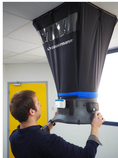
Use of the air flow meter