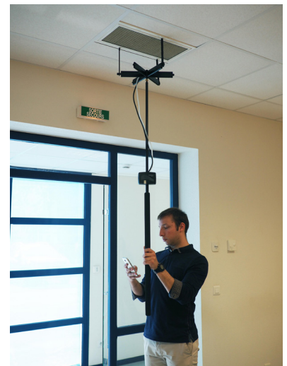
Use with the measurement grid